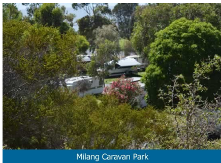
Milang Caravan Park