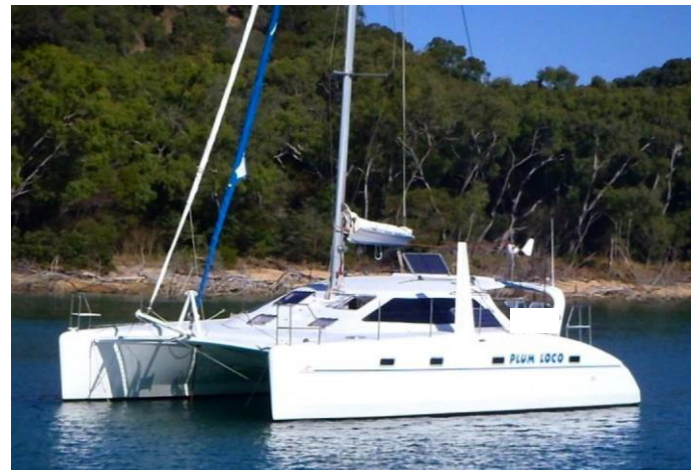
(photograph of a sistership)