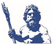
KING OF THE GULF