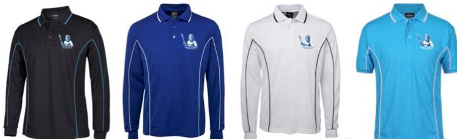
Short or long sleeve